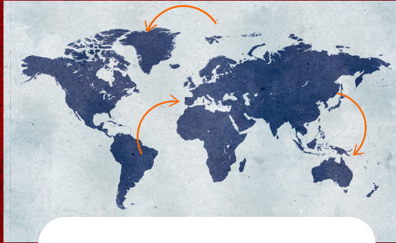
MOUNTAINS AND ISLANDS MOVED